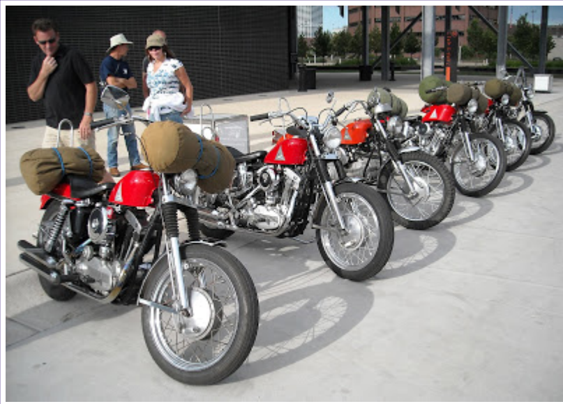
The third one back is a replica of the H-D Sprint used sometimes in the show for stunts.