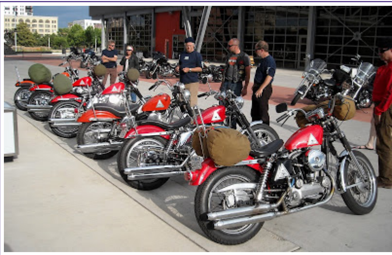
It really wouldn't be too hard to build one. Most I've seen are not completely correct.